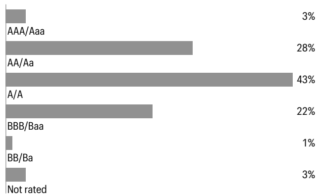
CREDIT QUALITY AS OF JUNE 30, 2023 1

time in history, the municipal yield curve also inverted but not to the degree seen in Treasuries.