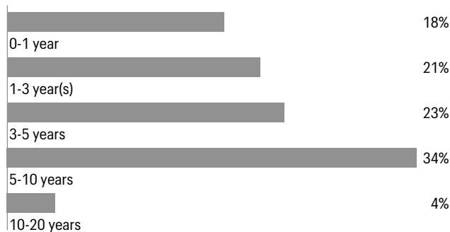
EFFECTIVE MATURITY DISTRIBUTION AS OF JUNE 30, 2023 1

1 Figures represent the percentage of the Fund's long-term investments. Allocations are subject to change and may have changed since the date specified.