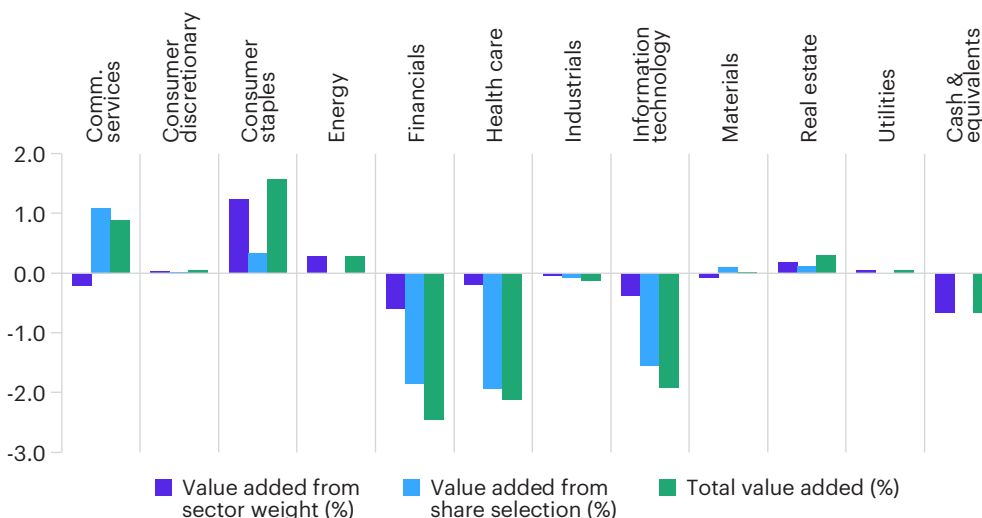
U.S. ALL CAP GROWTH FUND VERSUS RUSSELL 3000® GROWTH INDEX